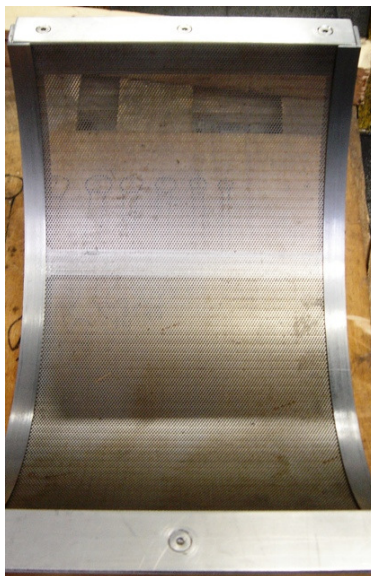
Detail 3: Top view

The screen cage design for the M type Mills has been updated.