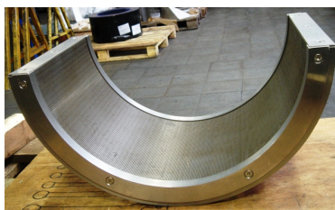
Detail 2: Side view